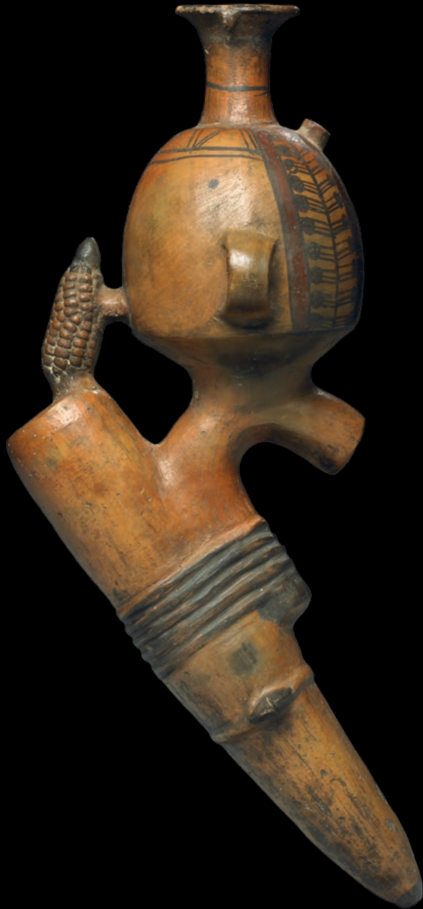
A paccha, a ritual Inca watering vessel, from Peru, Am1947,10.39.

In 2020 and 2021, in response to the Covid-19 pandemic, the British Museum took the very difficult decision to postpone the International Training Programme (ITP) which meant the ITP Annual Programme 2021 instead took place in March/April 2022. This resulted in the ITP 2022 being scheduled for later in the year and altered to consist of an onsite programme and online e-Learning.