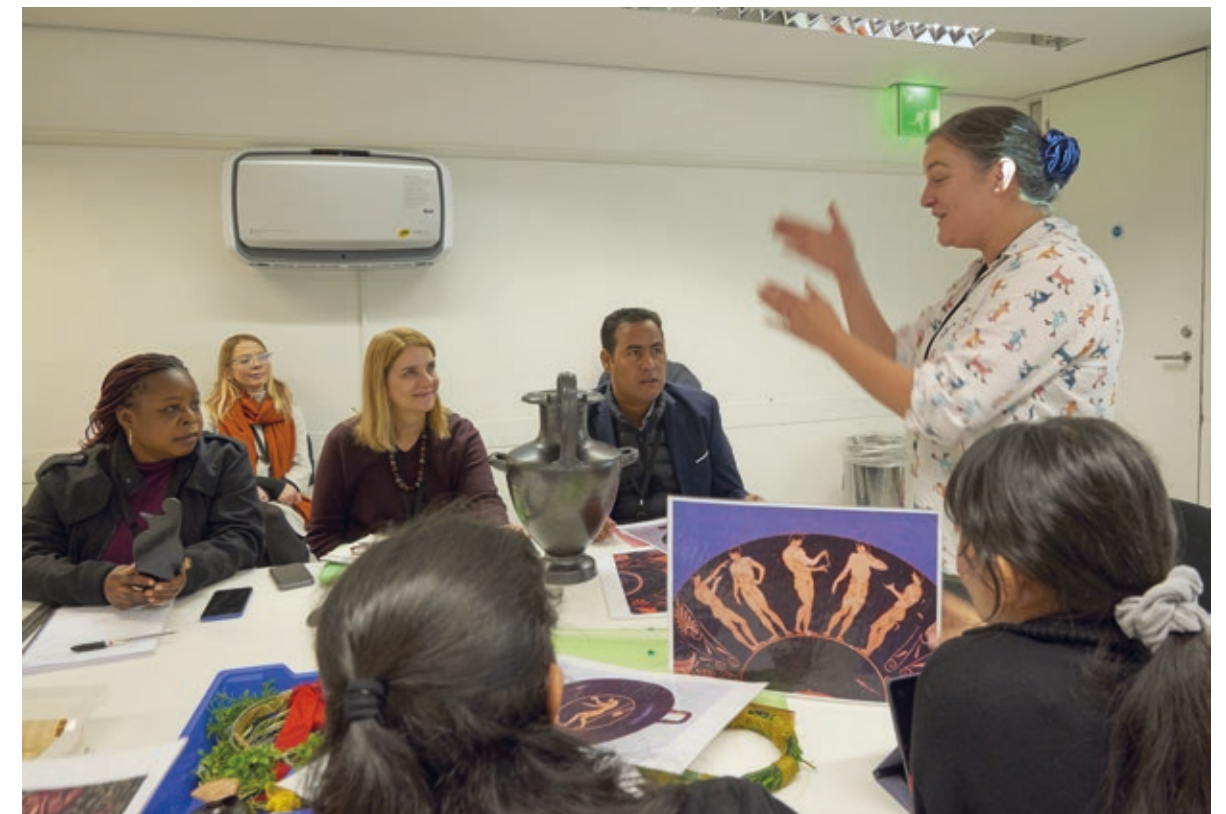
ITP Fellows 2022 taking part in a schools session.