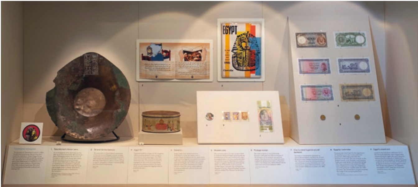
Tutankhamun today (Room 4).