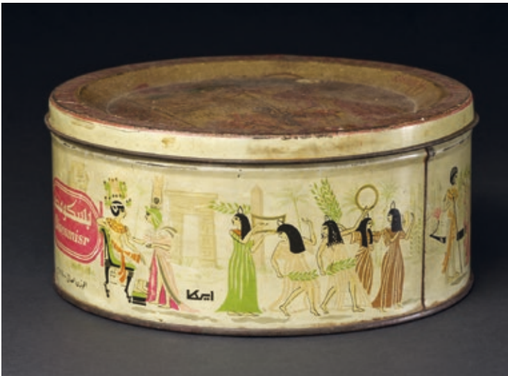
Right – A 1960s sweet tin decorated with images from ancient Egypt, one of them showing a scene from Tutankhamun's golden throne, EA 87803.

Heba was also able to support the British Museum’s Asahi Shimbun display in Room 3. The exhibition, Tutankhamun: reimagined , sought to explore both ancient and modern Egyptian relationships with the image of Tutankhamun, by placing both ancient and contemporary objects alongside each other.