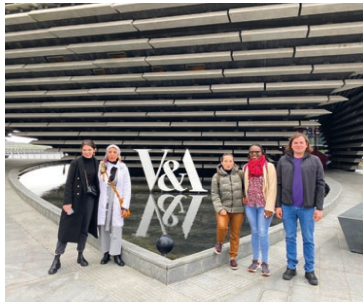
ITP Fellows from Armenia, Egypt, Romania, Rwanda and Uzbekistan at V&A Dundee.