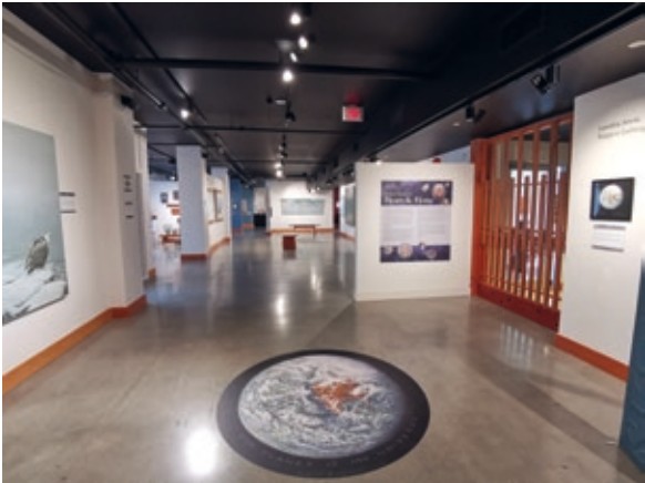
Top: CSMVS: A Green Museum and their Museum on Wheels.