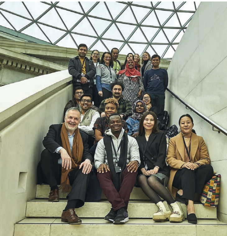
ITP Fellows 2021 with the Director, British Museum.

The Museum would also like to thank all the donors who wish to remain anonymous.