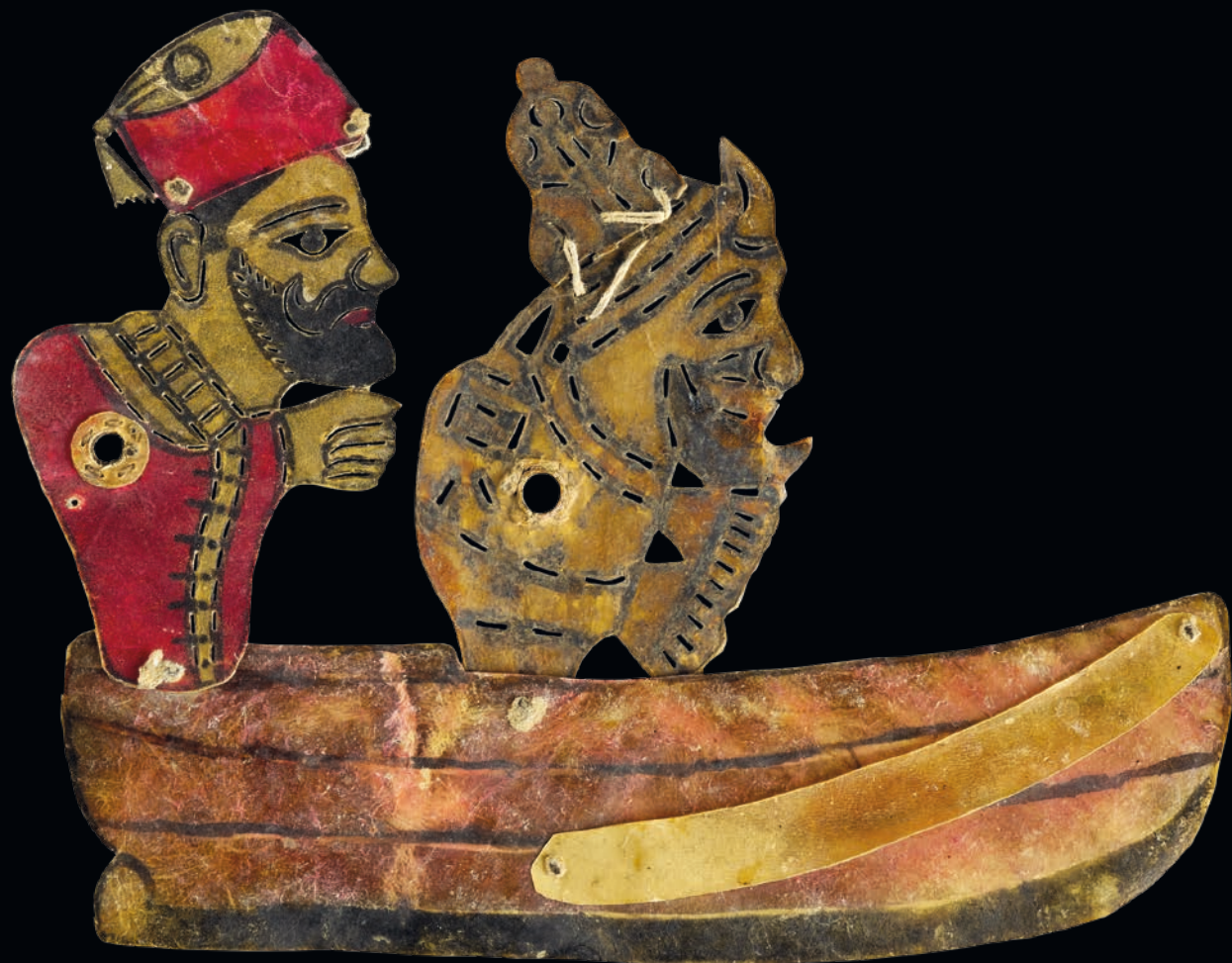
Turkish shadow puppet depicting two men (Karagöz and Hacivat) in a rowing boat, As1969.03.282.