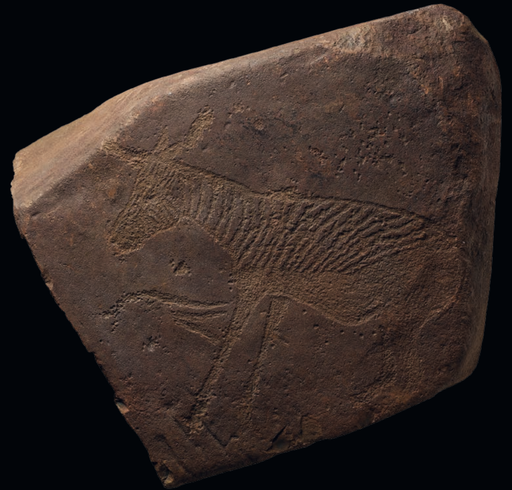
Lozenge-shaped Andesite block with engraving of a quagga or a zebra, Af1886,1123.1.